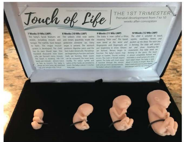
The Crow River MCCL donated a Touch of Life set to Holy Spirit Academy & The STMA ALIV Prolife Group