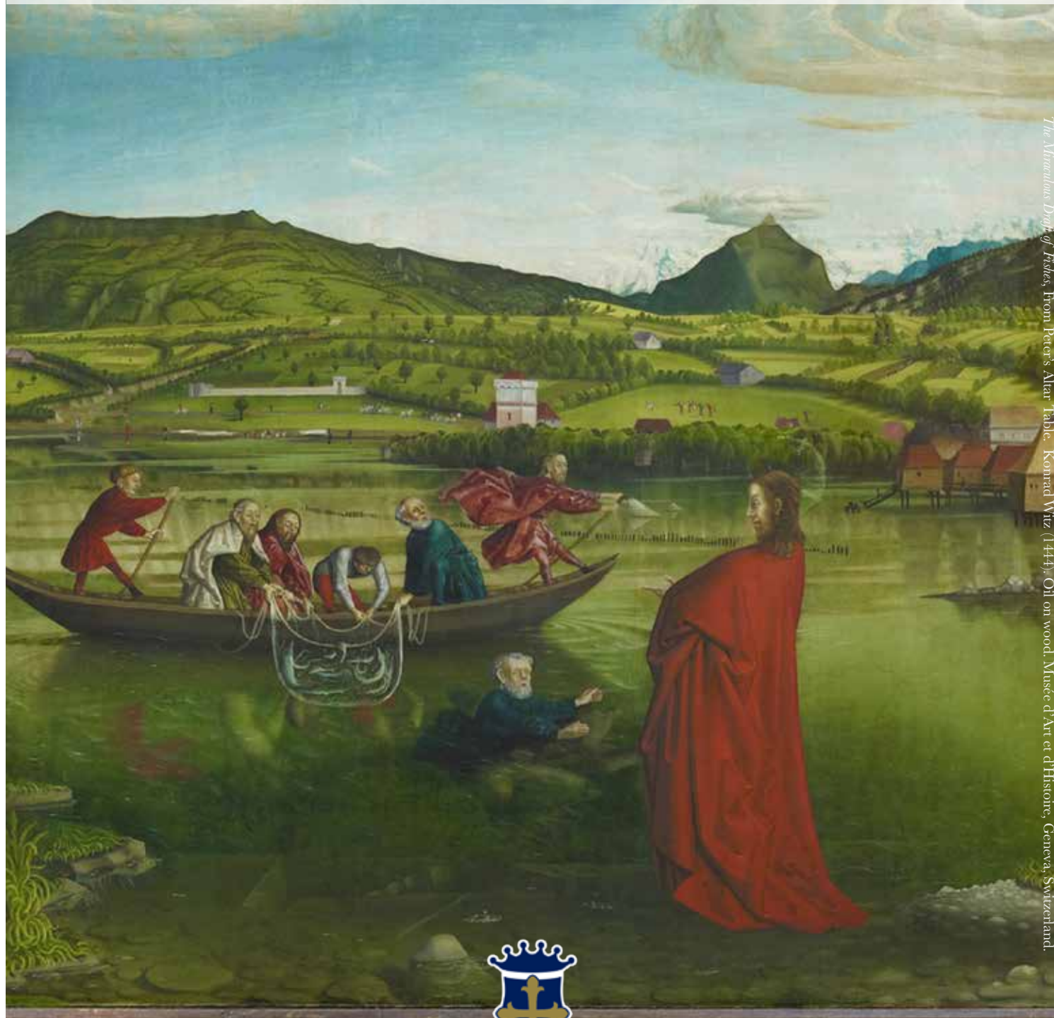
The Miraculous Drift of Fishes, From Peter's Altar Table, Konrad Witz (1444). Oil on wood. Musée d'Art et d'Histoire, Geneva, Switzerland.

Third Sunday of Easter • May 1, 2022 • Year C, Lectionary 48