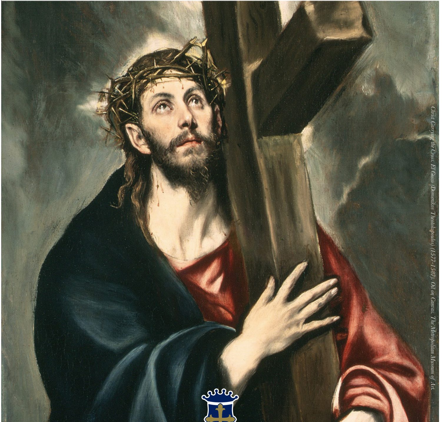
Christ Carrying the Cross. El Greco (Doménikos Theotokopoulos) (1577-1587). Oil on Canvas. The Metropolitan Museum of Art.

Twenty-third Sunday in Ordinary Time • September 4, 2022 • Year C, Lectionary 129