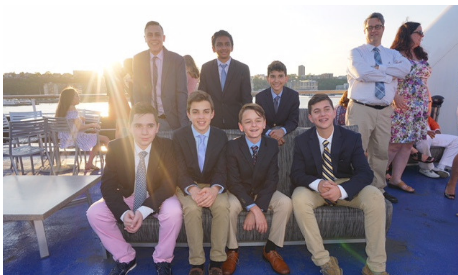
8th grade NYC trip