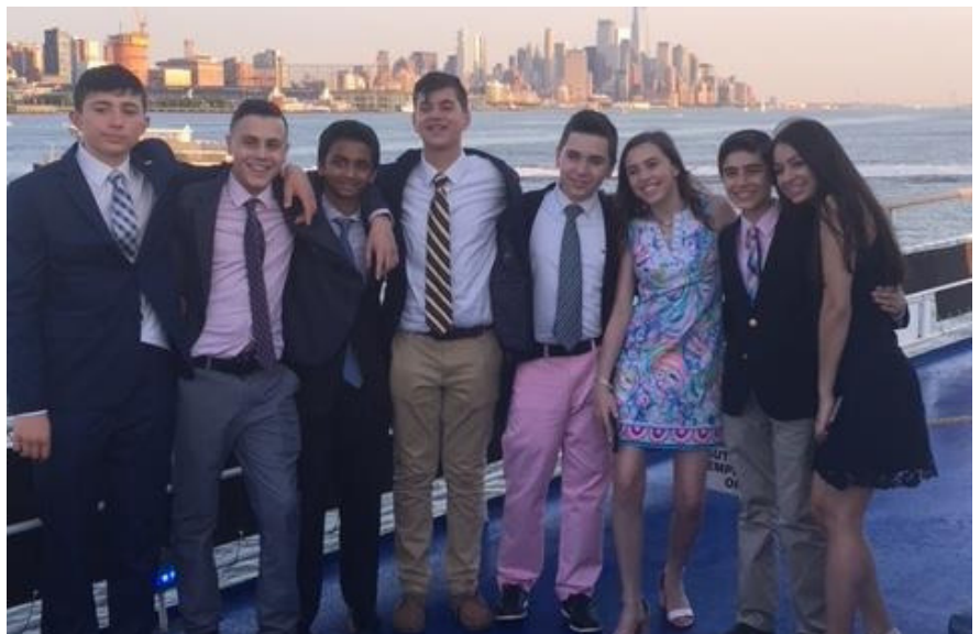
8th grade NYC trip

Budgeting and Investing are a great way for students to connect to the world of finance, to understand a little bit about what every day news reporting on the ups and downs of the "market" really mean. It's a joy to explore the world of finance with them. (As 6th graders, my junior high classes learn these concepts by way of a "game" called My Mathematical Life, where budgets and stocks are first introduced.) Now if only their gains could be realized in dollars!