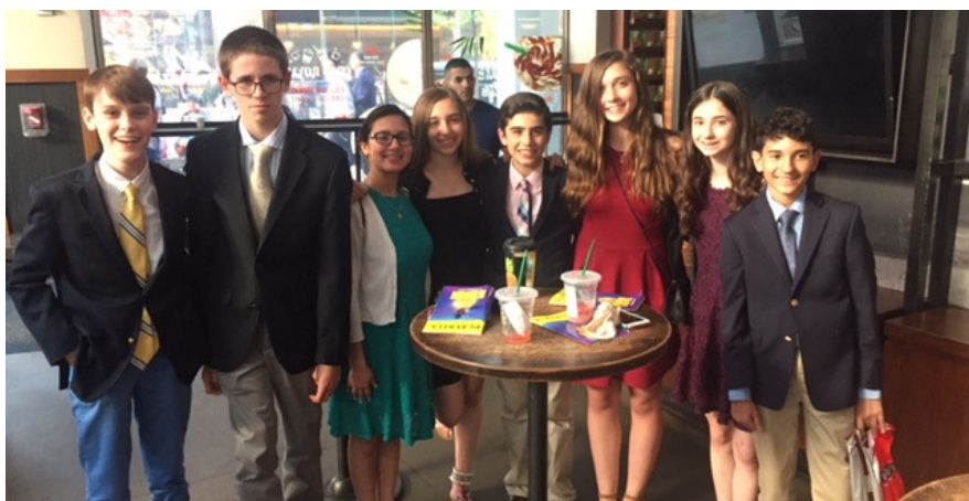
8th grade NYC trip