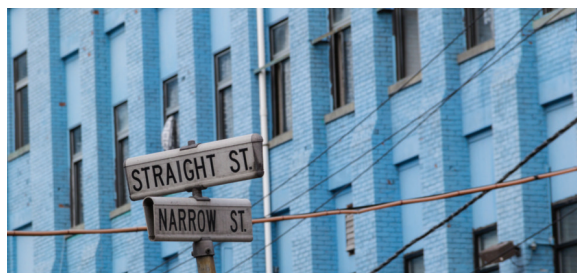
Straight and Narrow

Straight and Narrow Combats Opioid Epidemic, Increases Walk in admission hours.