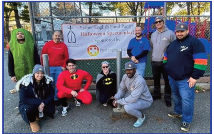
Thank you to Proof Logistics for their support of the Fr. English Food Pantry!