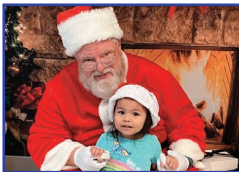
Santa came to visit many of our programs over the Christmas Season, including each of our 4 preschools.

Grant funding we have received in 2022 included: