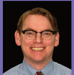
Executive Director Catholic Family and Community Services