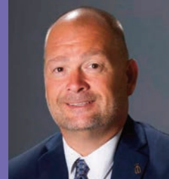
CEO, Catholic Charities