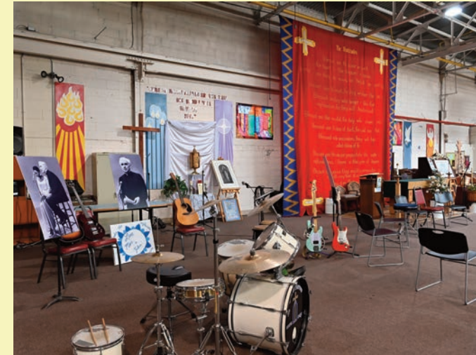
The Great Hall, at Straight and Narrow in Paterson.

Did you know? Straight and Narrow actually sits at the intersection of Straight and Narrow streets in Paterson. Straight and Narrow was featured in a Ripley's Believe it or Not globally syndicated piece in the 1950's highlighting this unique and poetic placement.