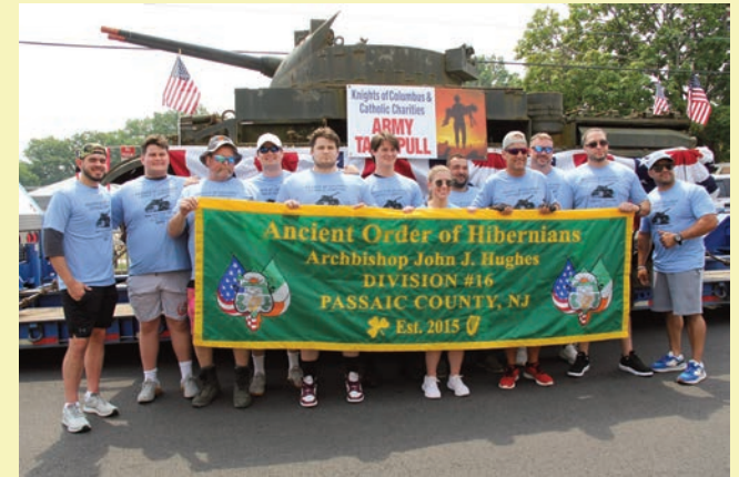
AOH Division 16 Team in front of the tank

Other endeavors included the 1st Annual Women Veterans Appreciation Event, held on June 13 th , Military Appreciation Month Luncheon at the William J. Mulligan VFW Post 281, and the Mountain Lakes Veteran Housing Project Groundbreaking Ceremony