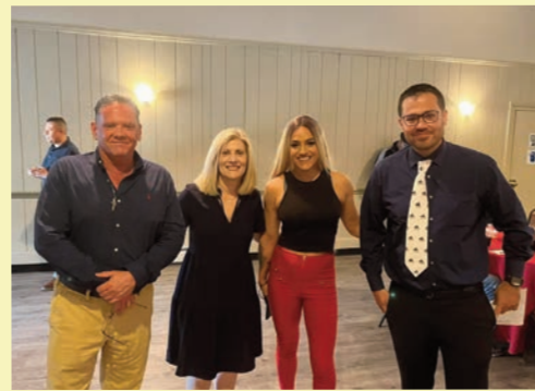
Recognizing our heroes at the Military Appreciation Month Luncheon in May