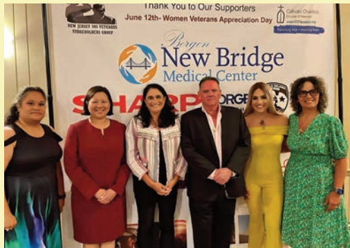
The first ever Women Veterans Appreciation Day dinner