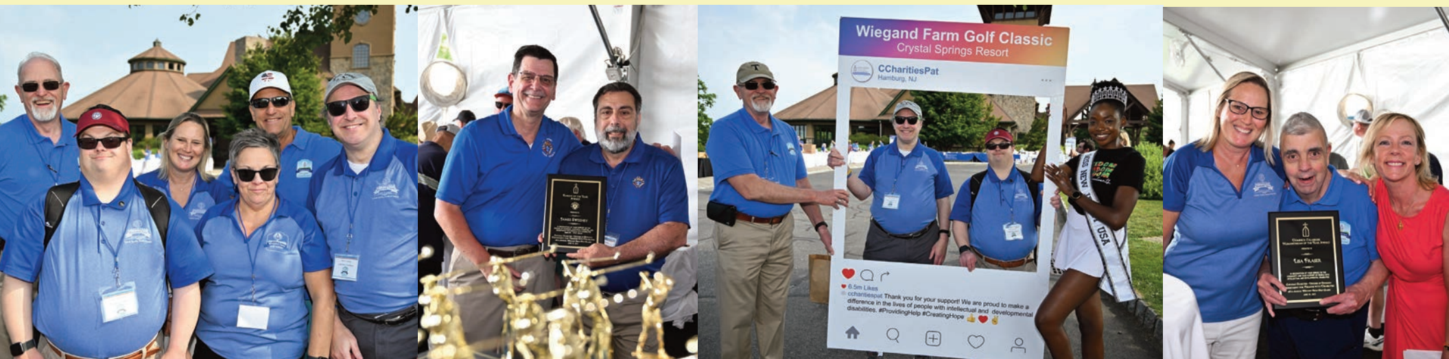
Scenes from the 49th Annual Wiegand Farm Golf Classic, a day of fun, celebration and impact!

This remarkable event, held on Monday, June 19th, brought together golf enthusiasts, kind-hearted individuals, and generous souls for a day filled with joy and compassion. We were immensely proud to welcome a gathering of 400 golfers to Crystal Springs Resort, where the sun shone brightly and the spirit of giving flourished. It was truly a day to remember—one that showcased the power of unity and the impact we can make together. We are immensely grateful to each and every one of you for being an integral part of this ministry. Your unwavering support, whether as sponsors, guests of honor from the Department for Persons with Disabilities, golfers, or members of our dedicated golf committee, has helped make this event a resounding success. As we reflect on this memorable occasion, we eagerly anticipate the future. Please mark your calendars and save the date for our upcoming 50th Annual Wiegand Farm Golf Classic, to be held on June 17th, 2024, once again at the beautiful Crystal Springs Resort.