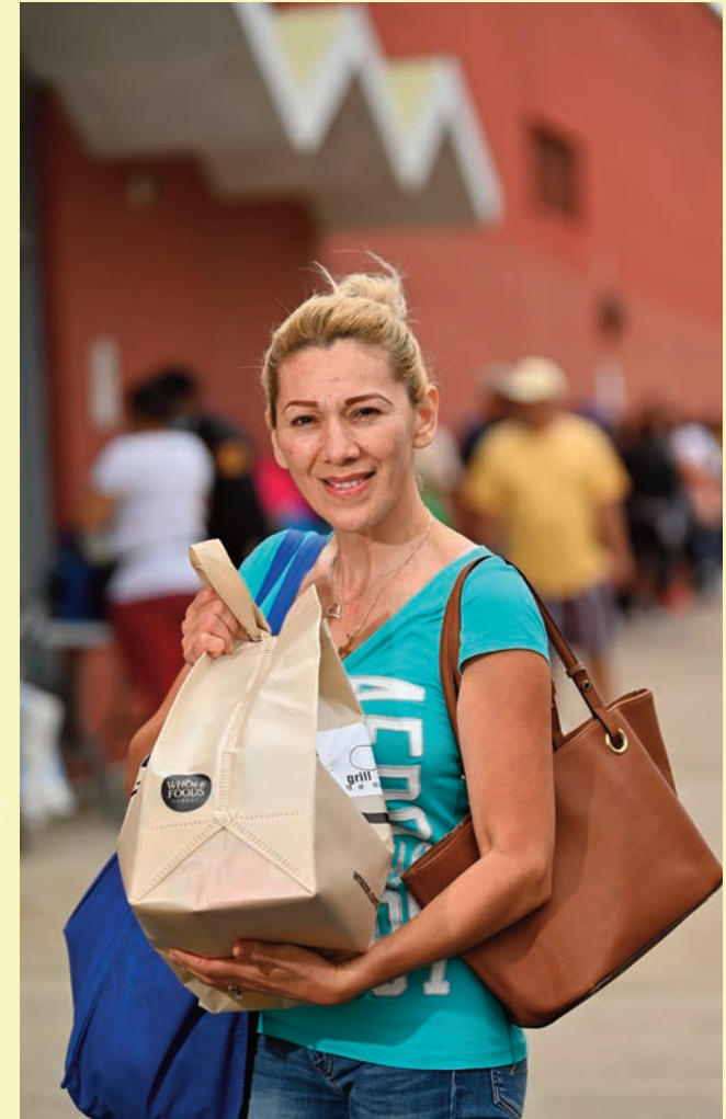
A shopper at our Fr. English Food Pantry in Paterson.

Did you know? The Paterson Adult Day Center was the first and currently the only Social Senior Day Center in the entire city of Paterson, established over 45 years ago.