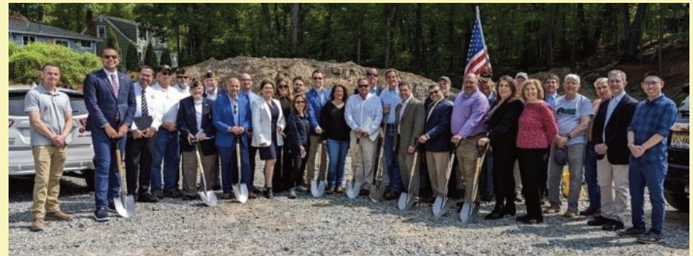
Members of our Veterans Team at the Mountain Lakes Veteran Housing Groundbreaking ceremony