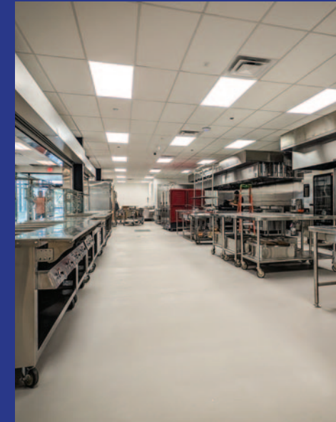
Straight & Narrow Rehabilitation Center Commercial Kitchen