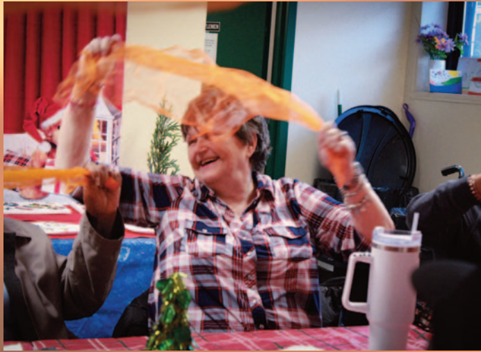
New Jersey State Council on the Arts, Sparky Seniors Program.