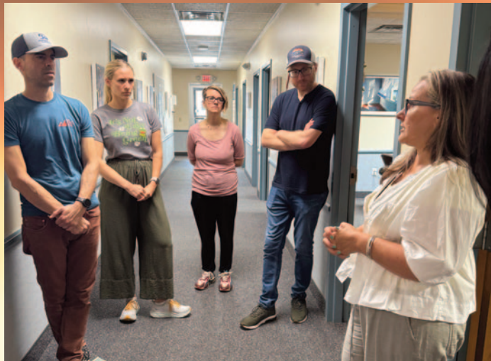
FM Kirby Foundation's team visit and tour of Hope House programs in Dover.