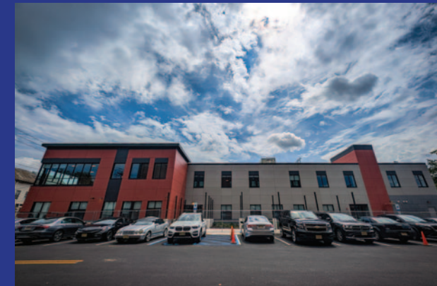
Straight & Narrow Rehabilitation Center Exterior