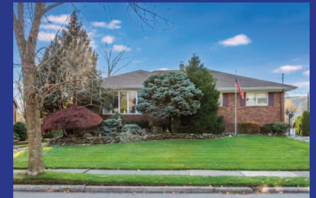
The new Murray House, coming in 2025.