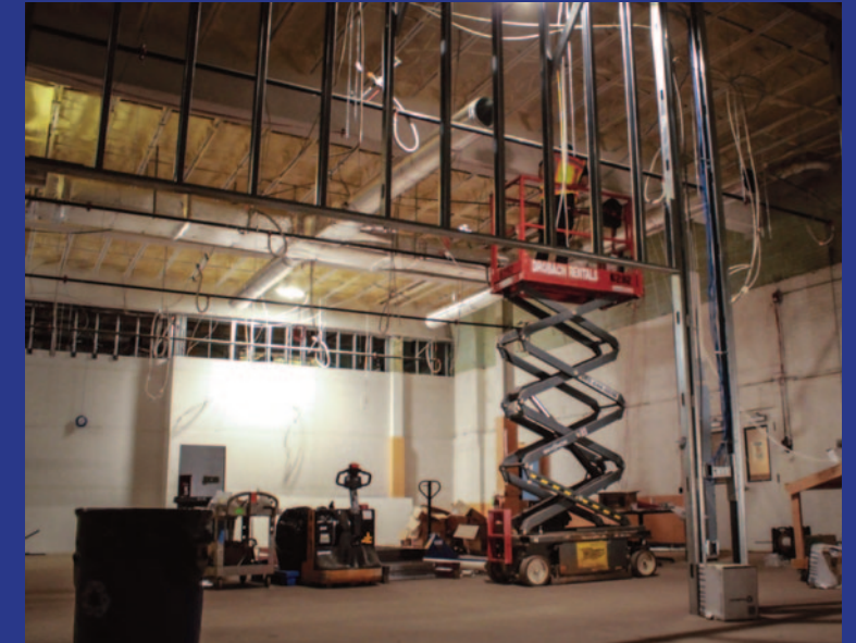
The Father English Food Pantry and Community Center, currently under construction.