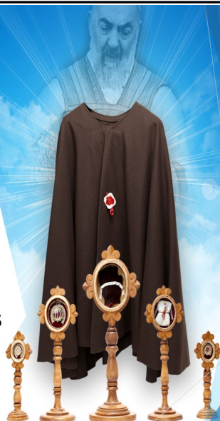
"The relics of Padre Pio"

email midlandsanmiguel@sanangelodiocese.org