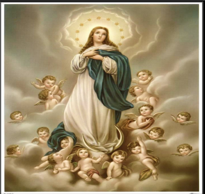
The Feast of The Assumption of the Blessed Virgin Mary

Please contact the parish office to register. Por favor contacte la oficina parroquial para registrarse.