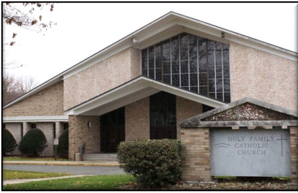
HOLY FAMILY CHURCH