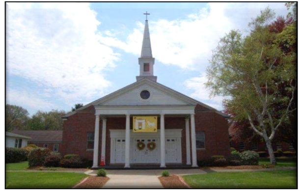
ST. BERNARD CHURCH