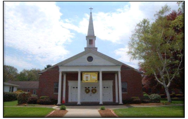
ST. BERNARD CHURCH