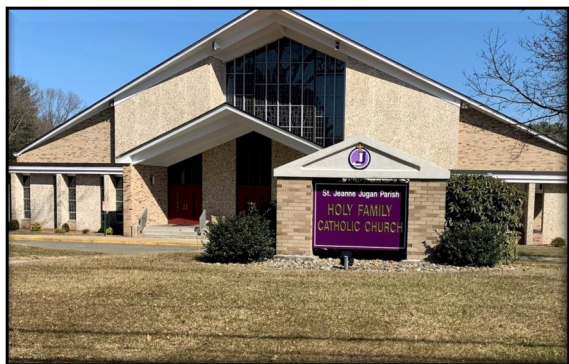
HOLY FAMILY CHURCH