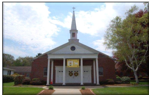
ST. BERNARD CHURCH