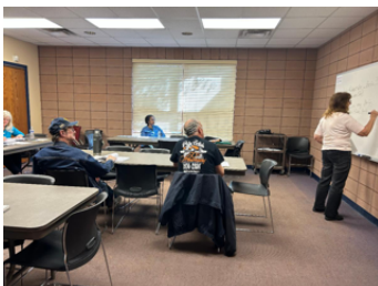
German I Class