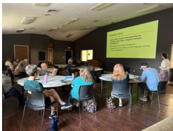
American Public Opinion Class