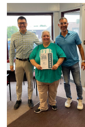
Fall Course Guides in mailboxes soon! Over 130 exciting course offerings!