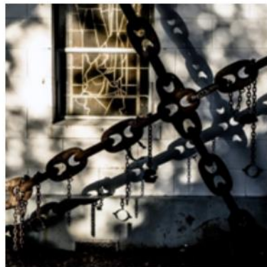
Tomb of the Unknown Slave

For nearly 200 years, Saint Augustine Catholic Church has welcomed people from every walk of life, creed, and color to worship side by side. Perhaps that is why Saint Augustine has not only served as the heart of the Tremé community but has also played an integral role in shaping the culture of the city of New Orleans.