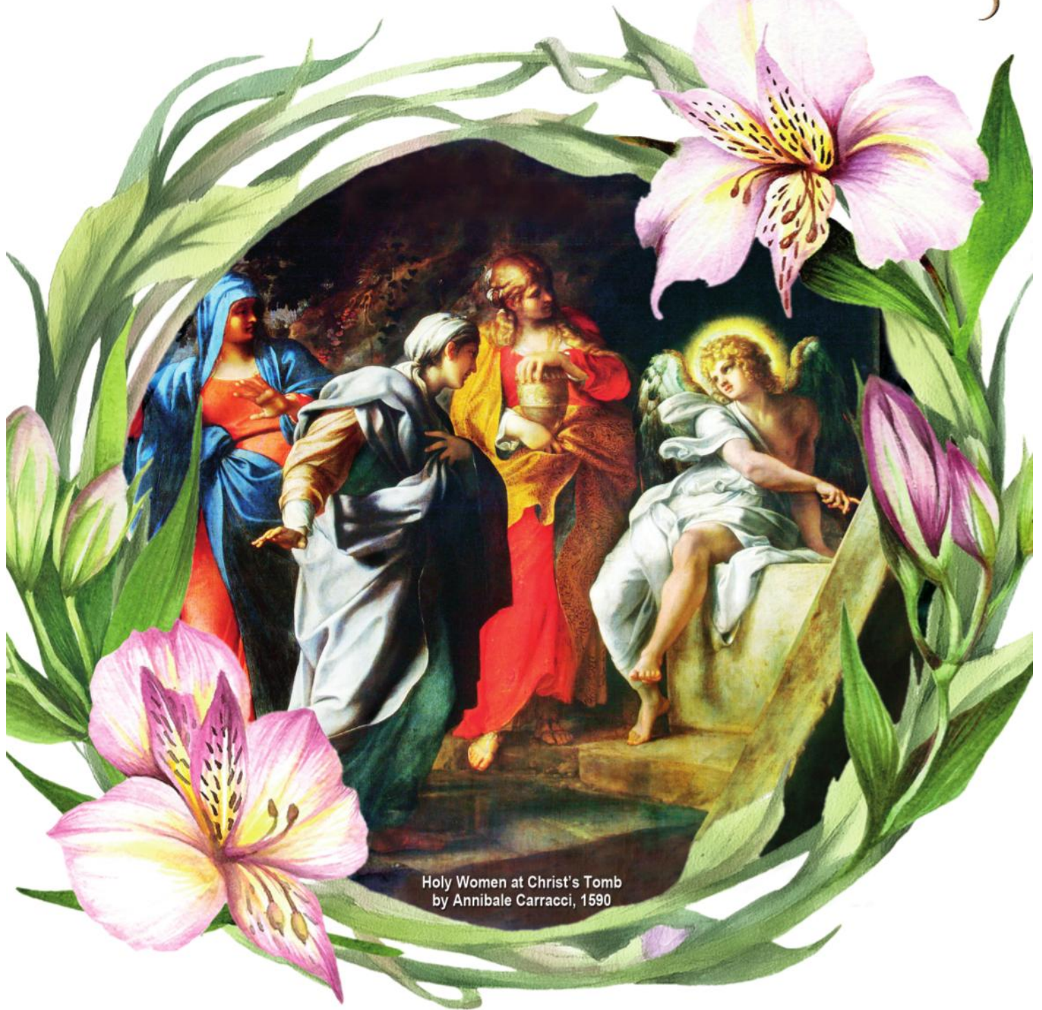
Holy Women at Christ's Tomb by Annibale Carracci, 1590

“Why do you seek the living one among the dead? He is not here, but he has been raised. ”