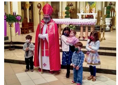
Photos with St. Nicholas on December 6 th .