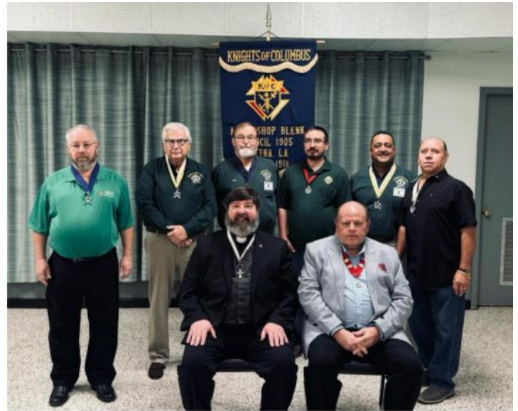
Knights of Columbus Archbishop Blenk Council #1905 Installation

Diving into the beauty of the Faith has never been easier: at home, on the go, or from any internet connected device. Discover thousands of books, audio talks, movies, documentaries, and studies... there is something for every member of the family to help them grow closer to Christ and His Church. Over 4,000 titles - now available on almost any device! Dozens of new features - all to help you enjoy the best in Catholic content Already have a FORMED Account? - Visit FORMED.org - Click Sign In - Enter your email Click the link in your email You're in! No more passwords! ^^^^ Want to create a new FORMED account Visit FORMED.org Click Sign Up Select "I Belong to a Parish or Organization" Find your parish by name or zip Enter your email - and you're in!