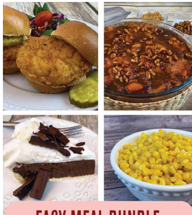
EASY MEAL BUNDLE