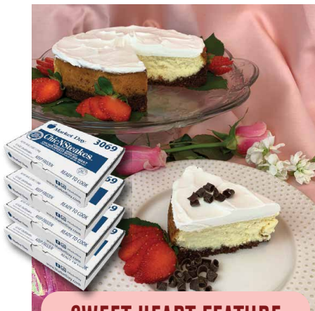
SWEET HEART FEATURE