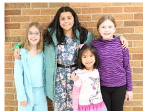
Favorite Color Day