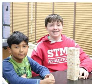
Board Games with Class Buddies