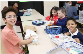
Lunch with Class Buddies