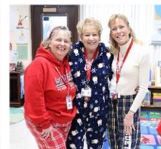
Pajamas & Slippers Day