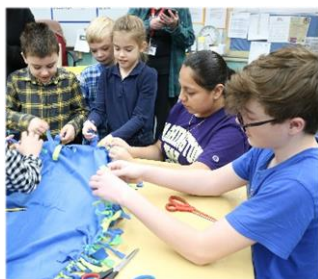
Making Baby Blankets