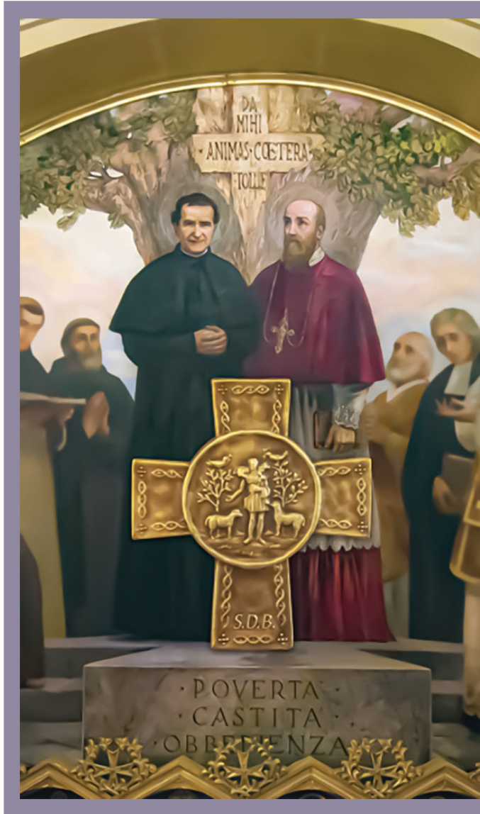
Don Bosco and St. Francis de Sales