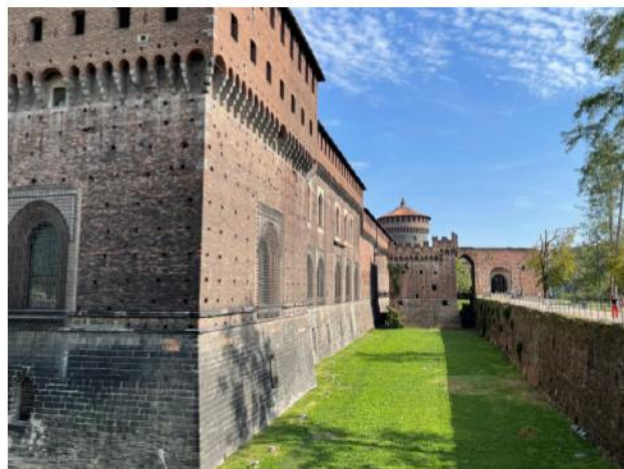
Sforzesco Castle and moat