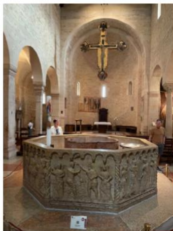
Church of Santa Maria Delle Grazie Baptismal Font