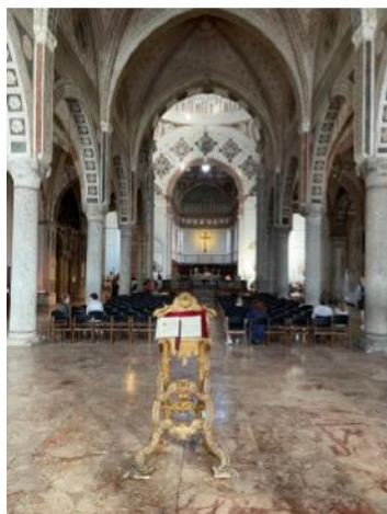
Church of Santa Maria Delle Grazie

This first day was shorter than the rest of the 8 days because the time difference of seven hours back in Louisiana. That being said, there is more to come about the eight days that we spent in Italy on Pilgrimage.