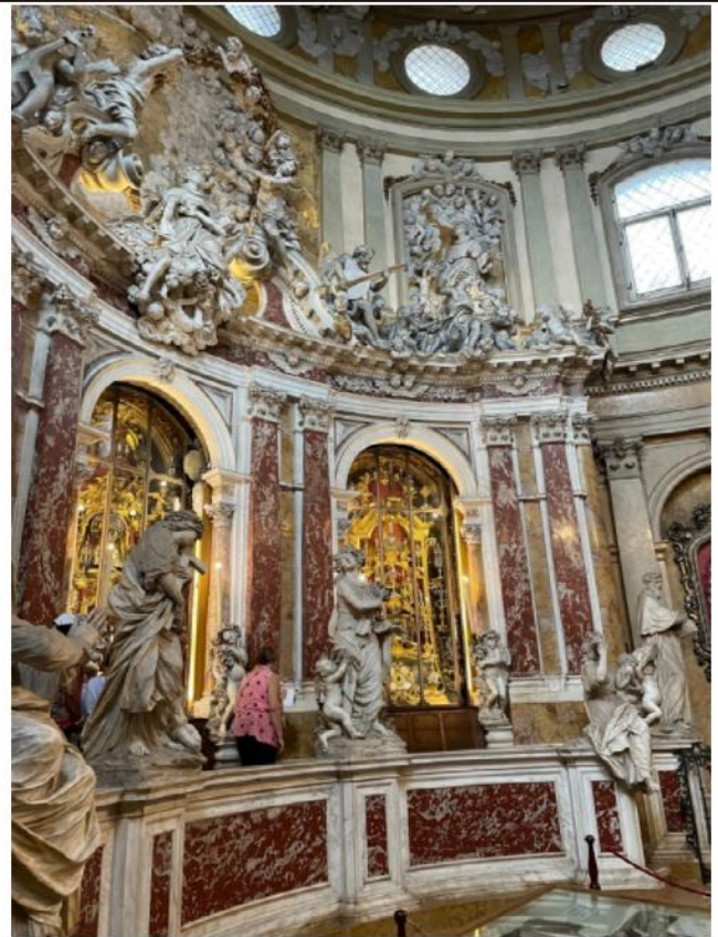
(above) Padua Relics