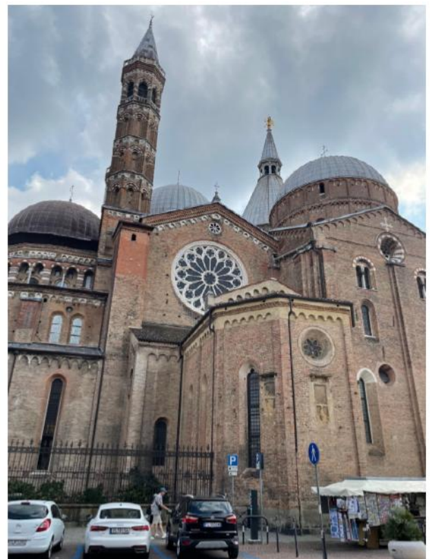
(below) St. Anthony Padua