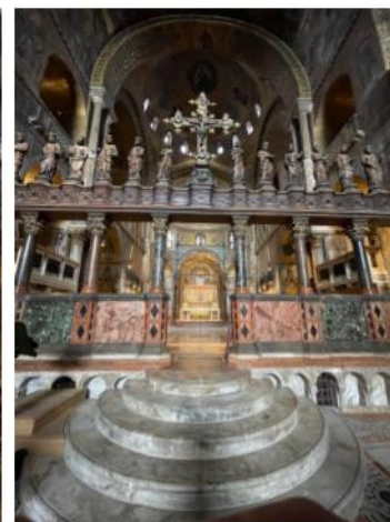
Bacilo of St. Mark