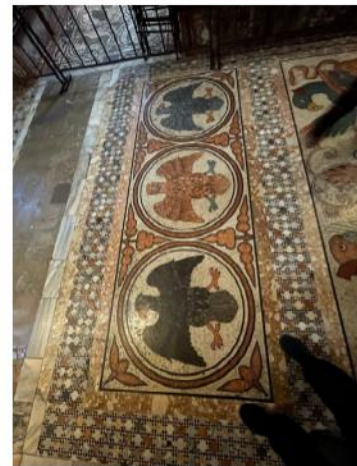
St. Mark Mosaic