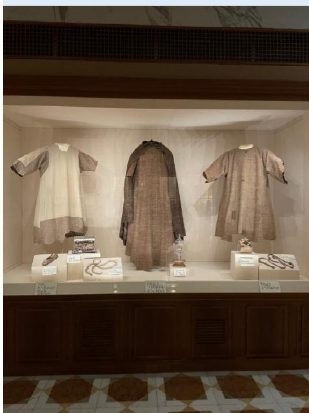
Top: Basilica of St. Francis