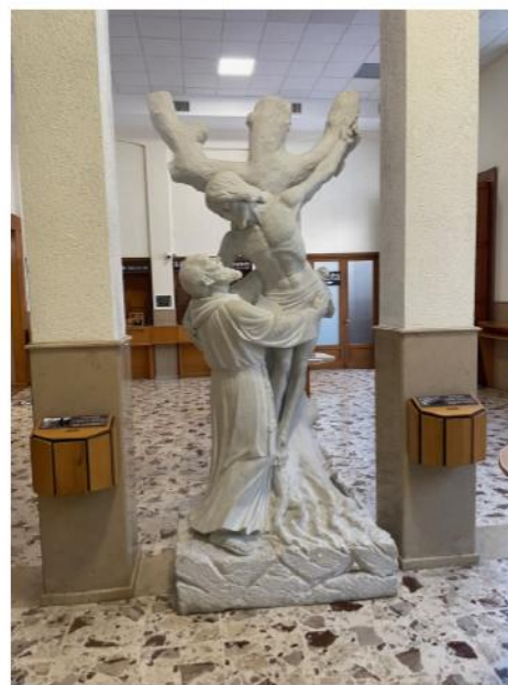
Statue of Jesus and St. Pio