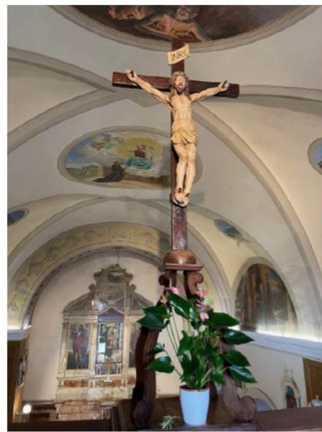
Crucifix where Padre Pio received his stigmata