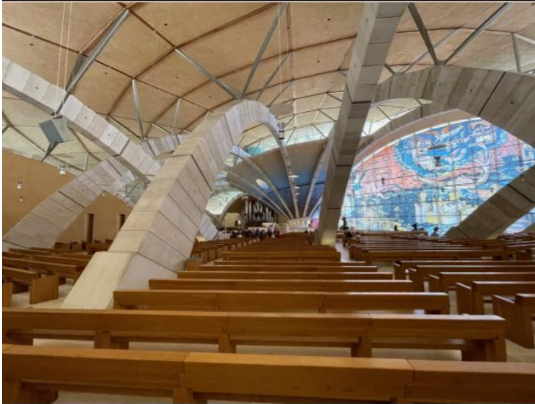
New Church of St. Pio