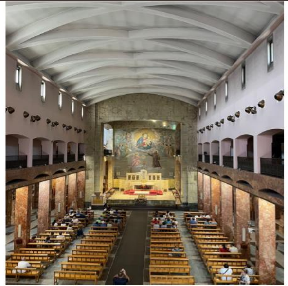
The old Church