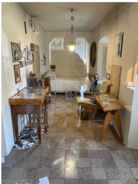
Bedroom of St. Pio

After this church, we journeyed on to the Cave of St Michael.