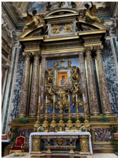
Icon Salus Populi Romani