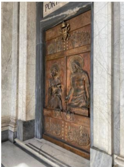
Bronze Door to St. Mary Major

If you want to know more about this Basilica check out the Vatican website which has a virtual tour. After this we went to the Basilica of St John Lateran. I will tell about it next week.