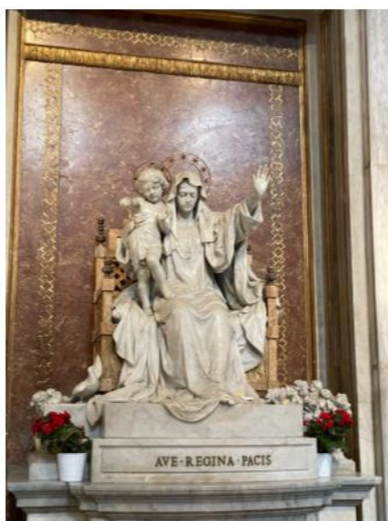
Marble Statue of Mary with Jesus