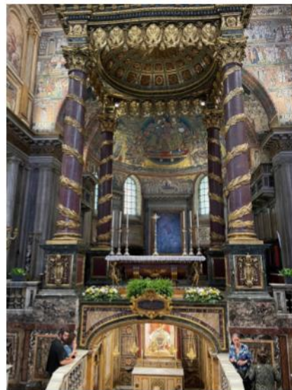
Main Altar St. Mary Major