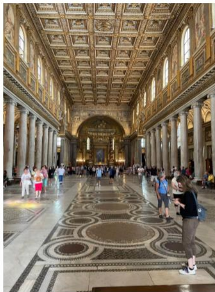
Basilica of St. Mary Major