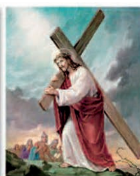
4th Sorrowful Mystery Carrying of the Cross