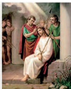
3rd Sorrowful Mystery Crowning with Thorns