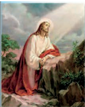
1st Sorrowful Mystery Agony in the Garden

Jesus arrives and is nailed to the cross. As He hangs, slowly dying, He is comforted by the presence of Mary, her sister, John and Mary Magdalene. Mary is strong. She has watched Him suffer and now die and she never leaves Him. I imagine her heartache. In his words to Mary, "Woman, behold, your son" all of us are entrusted to her love. I pray in thanksgiving for Christ's suffering and sacrifice so that I may be saved.