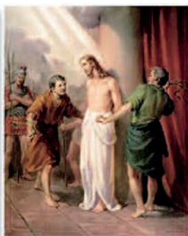
2nd Sorrowful Mystery Scourging at the Pillar