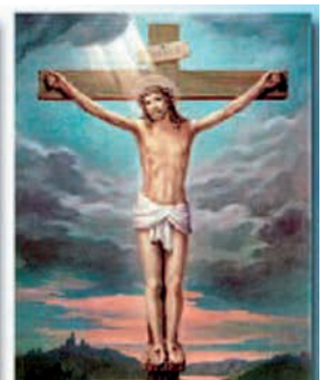
5th Sorrowful Mystery Crucifixion