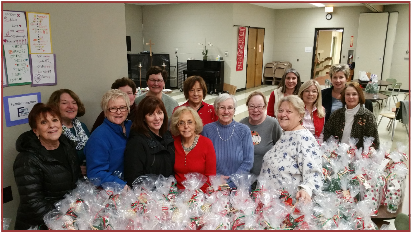
THE WOMEN OF ST. LUKE (WOSL) PROVIDE GIFT BAGS THAT ARE FILLED WITH TREATS FOR OUR ELDERLY.