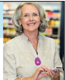
GPS Mobile Above

No Contract • No Fees • Easy Setup • md-medalert.com CALL 800-890-8615