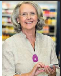
GPS Mobile Above

No Contract • No Fees • Easy Setup • md-medalert.com CALL 800-890-8615