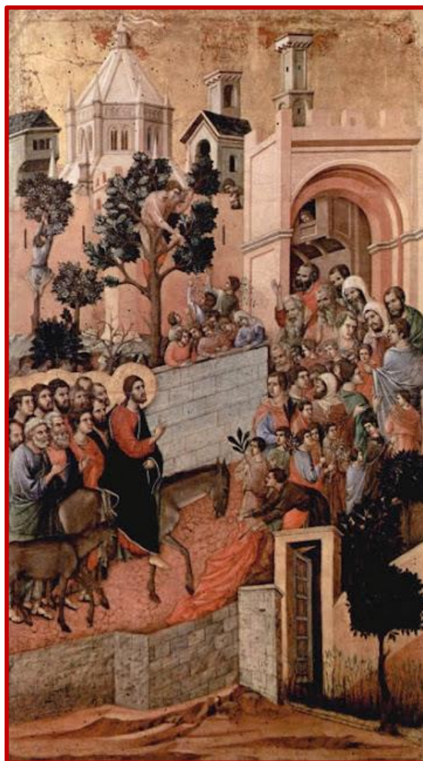
"The Entry into Jerusalem."