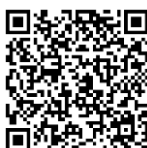
Holy Family Offertory