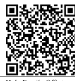
Holy Family Offertory

NO CASH? NO CHECK? NO PROBLEM! You can make a secure donation through OSV on-line giving to the Holy Family offertory by scanning this QR code!