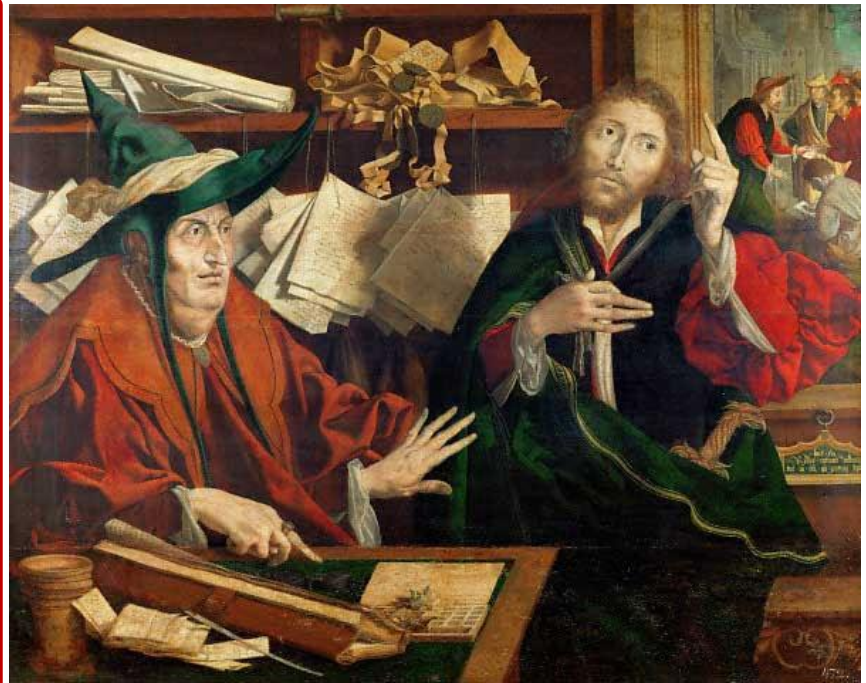
"The Parable of the Unjust Steward." Marinus van Reymerswaele 1540

YOUNG ADULT AND HIGH SCHOOL YOUTH CHECK INSTAGRAM FOR SCHEDULES. @HFAKYOUNGADULTS; @HFAKYOUTH