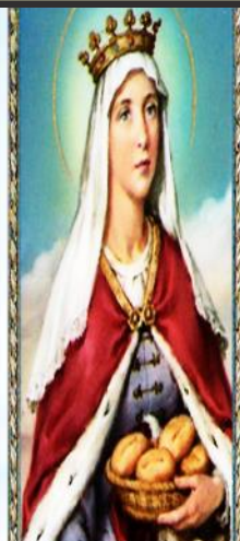
Saint Elizabeth of Hungary (1207-1231 A.D.) Feast day November 17

How could I bear a crown of gold when the Lord bears a crown of thorns? And bears it for me!