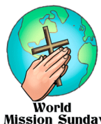
World Mission Sunday

In 1926 Pope Pius XI instituted Mission Sunday for the whole Church with the first worldwide Mission Sunday collection taking place in October 1927. The Mission Sunday collection is always taken on the next to last Sunday during the month of October. That day is celebrated in all the local Churches as the feast of catholicity and universal solidarity so Christians the world over will recognize their common responsibility with regard to the evangelization of the world. We ask that you pray and give generously.