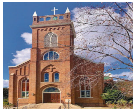
St. Patrick Catholic Church 2608 Davis Street