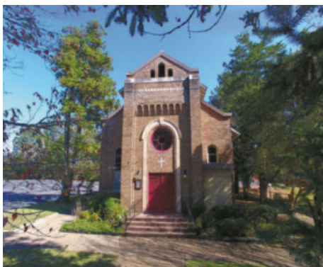
St. Joseph Catholic Church 1914 18th Avenue