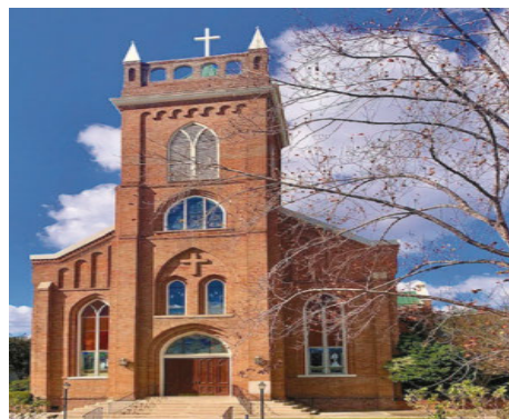
St. Patrick Catholic Church 2608 Davis Street