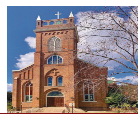
St. Patrick Catholic Church 2608 Davis Street