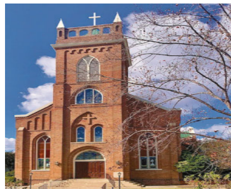
St. Patrick Catholic Church 2608 Davis Street