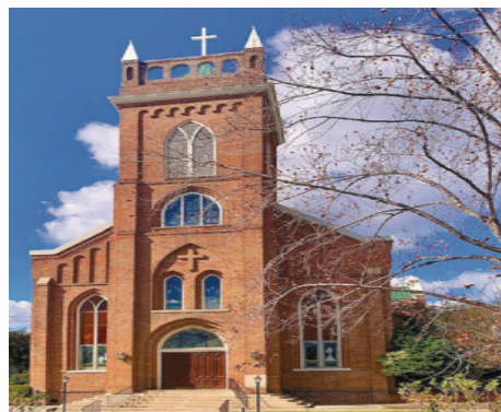
St. Patrick Catholic Church 2608 Davis Street