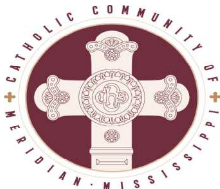
2601 Davis Street Meridian, MS 39301