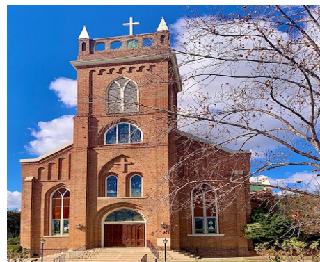
St. Patrick Catholic Church 2608 Davis Street