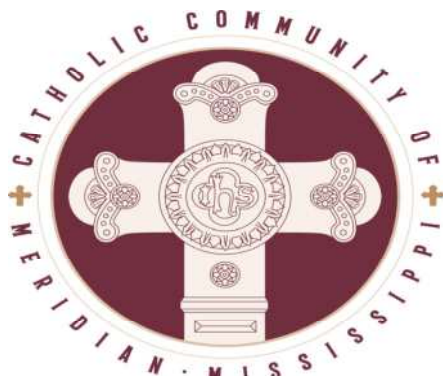
2601 Davis Street Meridian, MS 39301