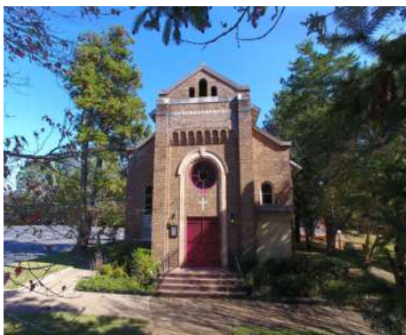
St. Joseph Catholic Church 1914 18th Avenue