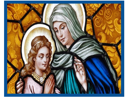
"Christ, the Anchor of our Hope"

In anticipation of the 138th annual Novena to St. Anne from July 18 - 26 , we will be featuring a weekly series in our bulletin to create awareness and inform our community about the purpose and events included in the annual Novena.