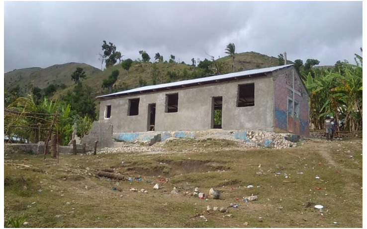
Except for the front facade of the building, this chapel in Bokolo was completely destroyed in Hurricane Matthew in October of 2016. We visited this village in the mountains during our trip to Haiti in May of 2017. Through the generosity of St. Mary's parishioners the chapel has been rebuilt along with a dispensary for the 200 families who live in the area.