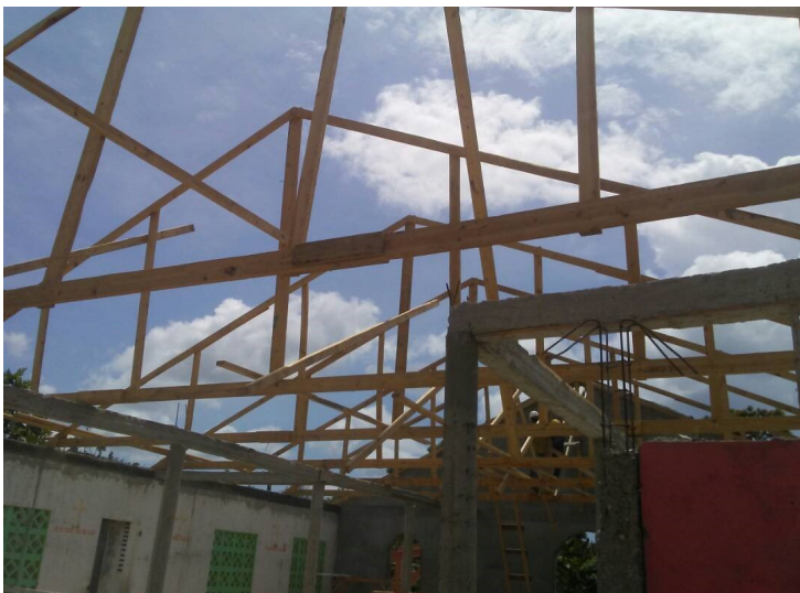
Our most recent project has been the rebuilding of the roof at the Chapel in the nearby town of Rosier not far from Roche-a-Bateau.

Support St. Michel's parish with a donation. Envelopes will be available for your support of our twinned parish and a second collection will be taken up at all the Masses.