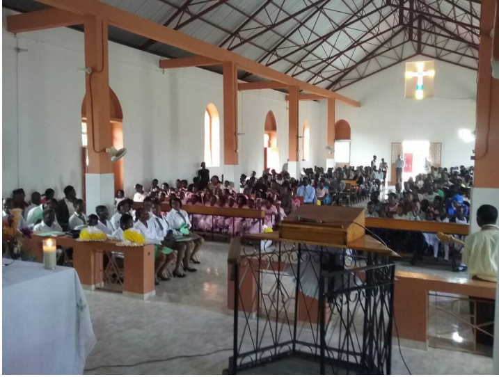
St. Michel's Church in Roche-a-Bateau. The main church was completely restored by the summer of 2017. St. Mary's donations paid for the new roof.