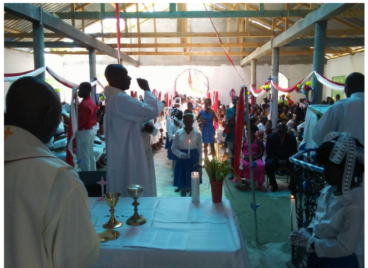
With the new roof almost completed at the chapel in Rosier the community celebrates First Communion on Palm Sunday.