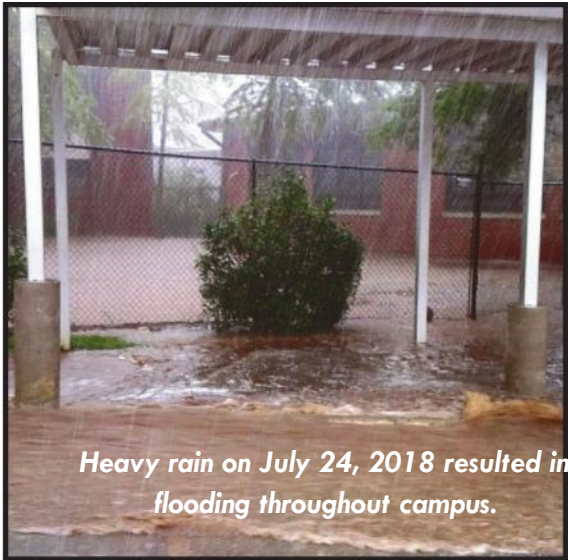
Heavy rain on July 24, 2018 resulted in flooding throughout campus.