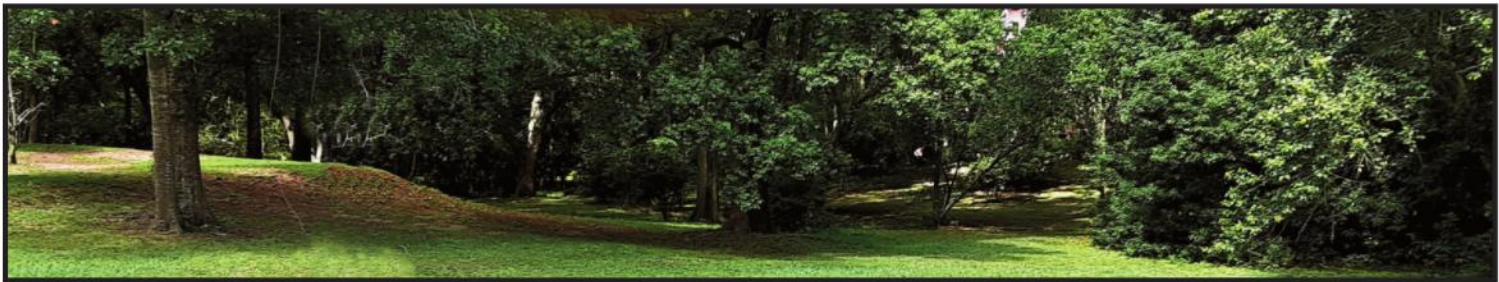
Newly acquired property will help us to address flooding on campus.