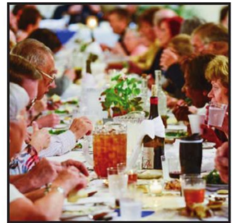
Parishioners are always our priority! Including during the COVID crisis.

Because this project is essential to our future, we are continuing with the planning, permitting, and groundwork to make our combined vision a reality.