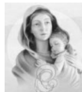
Knights of Columbus Baby Shower May 11th & 12th