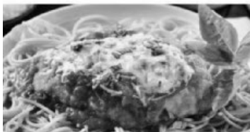
Chicken Parm Dinner Saturday, May 4th