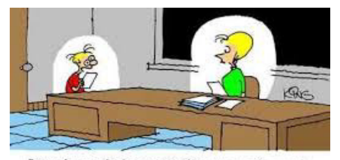
"Here's my 'What I did this summer' report. Some events were fictionalized for dramatic purposes."