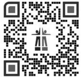
ST. URSULA PARISH