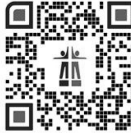
BLESSED SACRAMENT PARISH

Below are the QR codes for each of our parishes currently setup with Plently. Either click on the code to use the application on the device you are currently using, or use the camera on your smartphone to scan the QR code for the particular parish you wish to make a donation. If you have an older Android smartphone, you may have to install a scanning app – newer androids and all iPhones will scan without the scanning app. You will quickly be directed to the web application. (Please note: this option is currently not available for Our Lady of Victory Parish.)